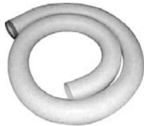
Extend Exhaust Duct