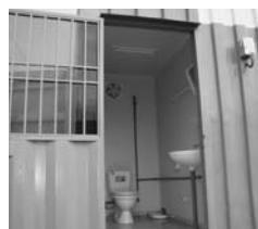
10 feet Toilet