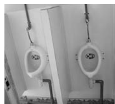
20 feet Toilet