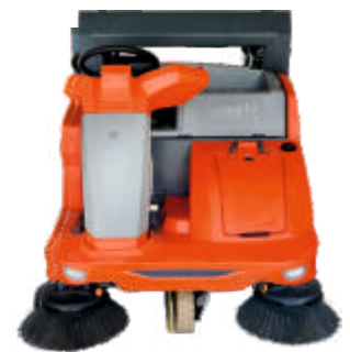
Sweeping width with Dual Side brooms