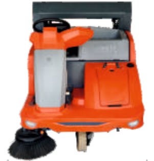
Sweeping width with One Side broom