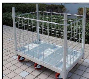
COMBINE WITH MESH FRAME