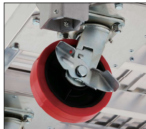
SMOOTH OPERATION SECURE STOPS WITH LOCK