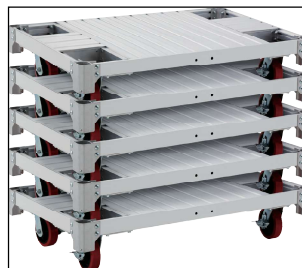
STACKABLE DESIGN EASY TO STORE-SPACE-SAVING