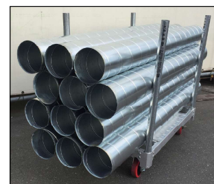
IDEAL FOR ROUNDS OR OVERSIZES ITEMS