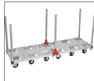
FLEXIBLE SETUP CONNECT SIDE-BY-SIDE OR STACK AS NEEDED