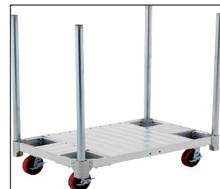
4-CORNER PIPE SLOTS BETTER CARGO STABILITY